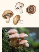
Fig. 1: Animals and plants based food source of vitamin D

Supplementing offers various animal species the best possible health, well-being, and productivity (Hoque et al., 2023).